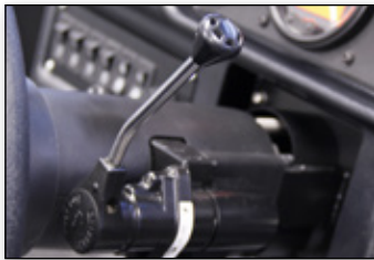
OEM retarder lever