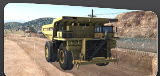
Safe Operating Procedures