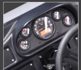
Conversion Kits utilize genuine Komatsu cab controls and instrumentation