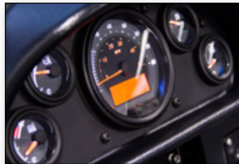
Genuine Komatsu gauges