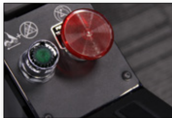
Emergency shutdown & fault reset switch