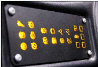
Warning light cluster displays machine health

The Conversion Kit includes a complete replica cab of the Komatsu 960E-1 haul truck, with fully functional controls and instrumentation sourced directly from Komatsu. These include an operational Komatsu warning light module and status panel that provide operators information on a wide range of vital machine functions, as well as featuring genuine Komatsu dash panel, gear selector, hoist control levers and automatic speed controls.