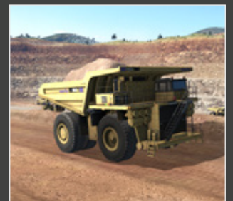
Accurate operational characteristics using technology and proprietary data licensed from Komatsu

With mining equipment becoming increasingly technically sophisticated, the level of information, experience and organizational competencies required to accurately simulate these machines also increases. Through Immersive Technologies' industry experience and exclusive alliance with Komatsu, you can be assured your training solution will be the only accurate and true representation of the real machine available.