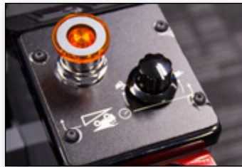
OEM retard speed control