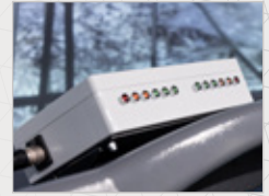
KomVision 360-degree vision system emulation (optional)