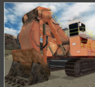
Accurate operational characteristics using technology and proprietary data licensed from Hitachi

With mining equipment becoming increasingly technically sophisticated, the level of information, experience and organizational competencies required to accurately simulate these machines also increases. Through Immersive Technologies' industry experience and exclusive alliance with HCM, you can be assured your training solution will be the only accurate and true representation of the real machine available.