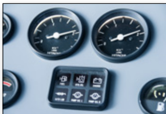
Engine and temperature level indicators