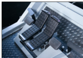
Bucket and track pedals match real machine cab