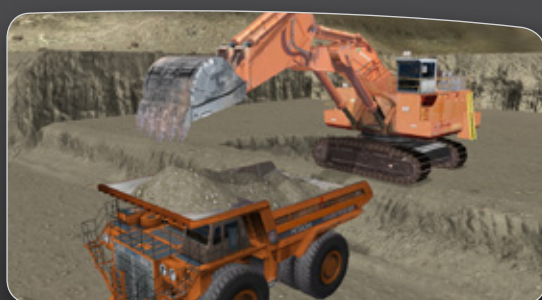
Safe Operating Procedures