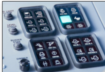
Fully functional indicator panel