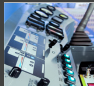
Conversion Kits® utilize genuine Hitachi cab controls and instrumentation