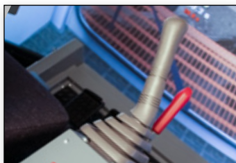
Dual axis control joysticks and functional lock lever