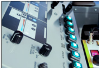
Easy-to-Monitor Curved instrument panel and simulated radio module

These include an operational Easy-to-Monitor Curved Instrument Panel, positioned so that the operator can continually monitor the status of key functions during operation, and back-lit meters and monitors.