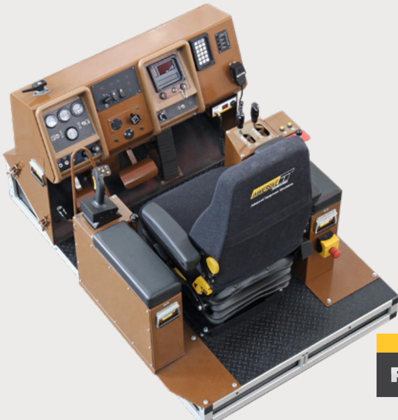
Gauges and tachometer