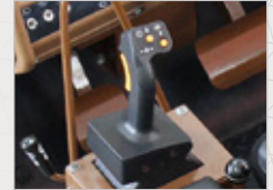
994D Bucket controls