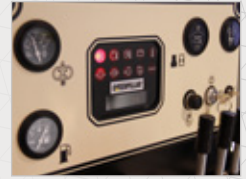
Machine Operation Switch Panel