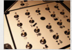
Mast, levelling jacks & throttle levers