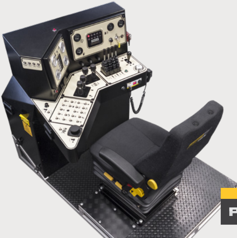
Caterpillar Engine Monitoring System