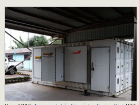
Year 2003: <u>Transportable Simulator Series 2</u> at KPC office in Indonesia.

Immersive makes significant investment every year to ensure the longevity and upgradeability of their customers' simulator assets. Through clever design and <u>customer support packages</u>, Immersive Technologies is able to install the latest specification computer hardware and software into most