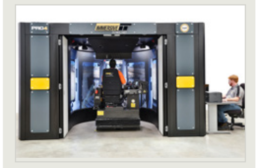
Year 2017: <u>PRO4 Series</u> designed for surface mining with realism at a level not previously seen in the industry.

of its deployed simulators. Throughout 2017 Immersive upgraded 68 mining operations to the latest generation technology with both computer and software upgrades. A further 125 were upgraded to the latest generation of software. Additionally, customers are taking advantage of the modular nature of their Immersive Technologies simulators by installing brand new Conversion Kit modules to keep step with their changing machine fleets on site. With Immersive Technologies, miners are equipping their teams to meet operational challenges, today, with simulation assets they bought well over a decade ago.