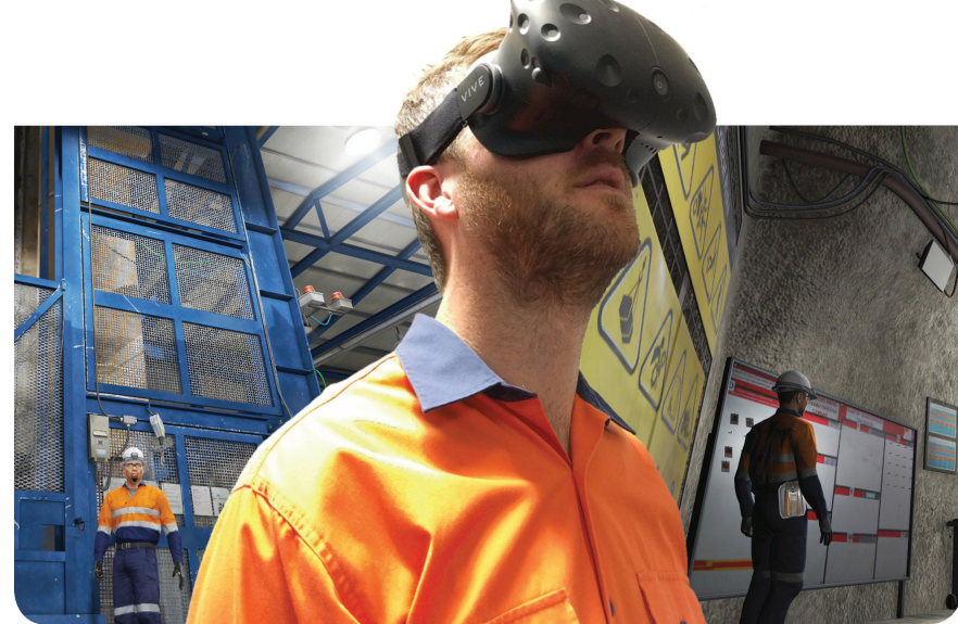
Photo: WorksiteVR™ Quest allows users to virtually experience, engage and understand surface and underground environments, safety hazards and emergency situations. Video Link