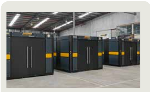
PT Freeport Indonesia has invested in the largest operator training simulator deal of 2015. Immersive Technologies has reported the company has added light vehicle, underground LHD, underground truck, jumbo drill, underground locomotive and Cat® Command for Underground simulators to their training program.

The Grasberg minerals district contains one of the world's largest copper and gold deposits and focuses on local hiring and skills development. Their regional technical training programs prepare community members for careers in mining and have utilized simulators from Immersive Technologies for their surface operations since 2001.